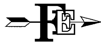
EXHIBIT # 12