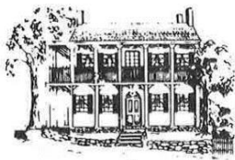
Phoenix House c. 1820