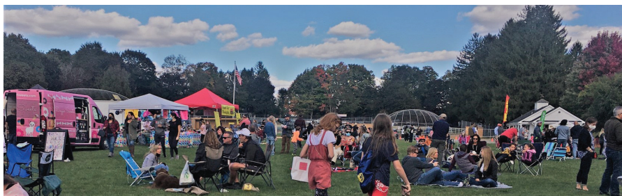
Mendham Borough / Jersey Fest Food Truck and Music Festival at Borough Park