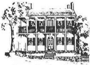
Phoenix House c. 1820