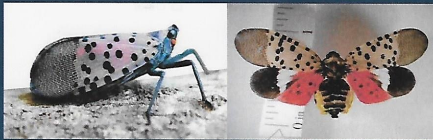
Adult Spotted Lanternfly, present in autumn months.

If you find any of these life stages of the Spotted Lanternfly, remove, devitalize, place in a sealed bag, and dispose of bag in the garbage.